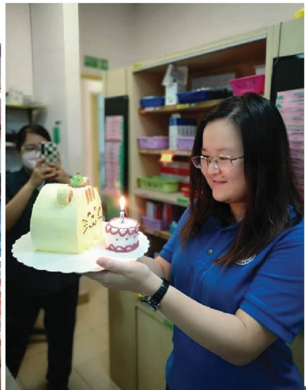
Homemade birthday cake by PFYM 2022