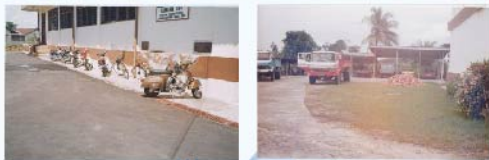
Photos on the right: View of Divisional Pharmaceutical Laboratory and Stores Sibu and the compound in the early 2000's

Sibu Medical Store was separated from the main building of Lau King Howe Hospital in 1971. It was renamed to Divisional Pharmaceutical Laboratory and Stores, Sibu (Makmal Ubat dan Stor Bahagian Sibu) and provide wider service coverage along the Rejang basin towards Mukah area, as well as the transit point to the upper stream of Rejang river in Kapit, due to its strategic location in the central region of Sarawak.