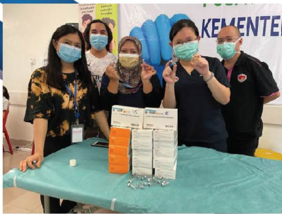
Group photo after hectic Sinovac day