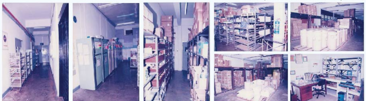
Views of Storage areas in Divisional Pharmaceutical Laboratory and Store Sibu in the early 2000's