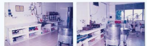
Views of production unit in the early 2000's