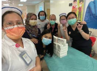
Group photo with staffs on-duty for COVID Vaccination Program 2021