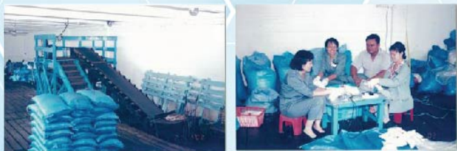
Salt Iodisation plant (left) and prepacking activity by the Pharmacy Assistants (right)

In 1959, there was a campaign launched as part of the government's initiative to lower the prevalence of Goitre among rural populations in the Rejang basin. The rural populations, particularly those who lived in the highlands and jungles, had a shortage of iodine. Hence, to iodize the coarse salt, a salt iodization plant was constructed in Sibu Medical Store. It was designed and constructed entirely by local mechanics. The green colored iodized salt was distributed via exchange basis with the coarse salt. The slogan 'Buy Green and Avoid Goitre' was used to promote the iodized salt to the public and the program was a huge success.