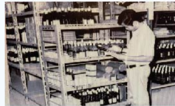
A storekeeper checking inventories using Cardex system, an old system before the first computer was introduced in 1991.

To manufacture galenical products such as syrups, mixtures, creams and ointments.