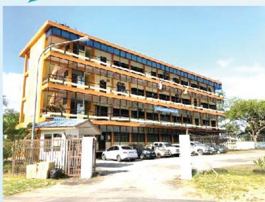
Top: Salt Iodisation plant