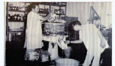
A classic view of making creams and ointments in Sibu Medical Store before commercial products were available in the market.