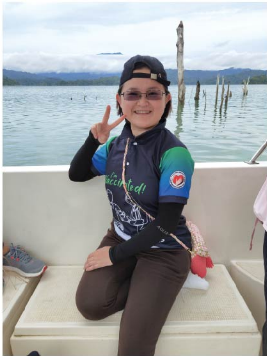
At Bakun Lake – on the way to long house for Outreach COVID Vaccination Program