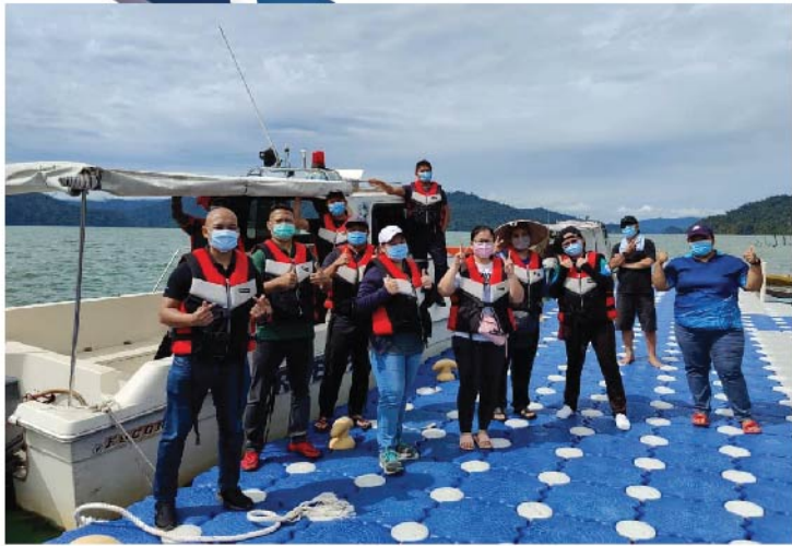
3rd from the right – group photo before departing for COVID Vaccination Program at Bakun long houses