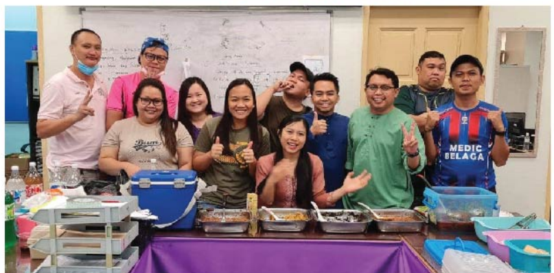
Gawai Raya makan-makan in PKD 2021