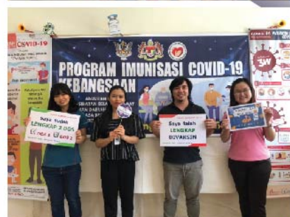
Pharmily photo during COVID Vaccination programme 2021