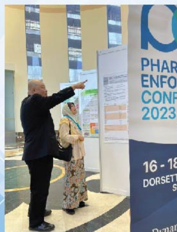
Picture 3: Sarawak Pharmacy Enforcement delegation going through the conference posters

It was a great conference for the Sarawak Pharmacy Enforcement Branch as they came back winning the R&D Category and was 2nd place for the Quality Category. Congratulations to the team and the presenters!! The whole Sarawak Pharmacy fraternity are proud of you!