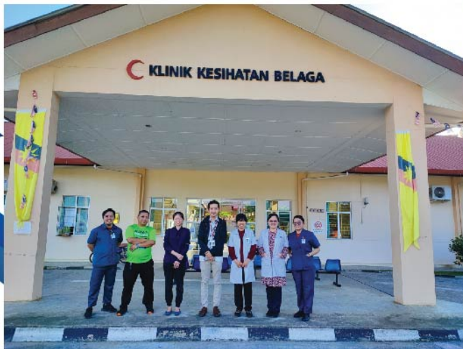
Photo with auditors post ADAP 2023

Work aside, life here is simple, peaceful and very much enjoyable. I love waking up to a beautiful panoramic mountain view outside my window. I love the after-work jogs, enjoying the fresh air and evening breeze. I enjoy saying "Hi" to little friends from Mother Nature like Rhinoceros beetles and Rajah Brooke's birdwing butterfly, and many more rare creatures that can only be seen in captivity in the cities but are abundant here. I love to pause and look up during on-call nights, and admire the glittery starry night sky. Despite the fact that I had to stay far from home, I felt warmth from the caring, friendly close-knit community here.