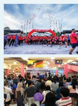
Bottom: Prepacking of salt Sibu Pharmacy Run (top) and Pharmacy Health Carnival (bottom) in conjunction with World Pharmacists' Day 2019