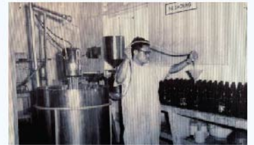
Filling bottles using plastic hose was practiced before the bottle filling machine was available. Note that the bottles in the picture were cleaned beer bottles.