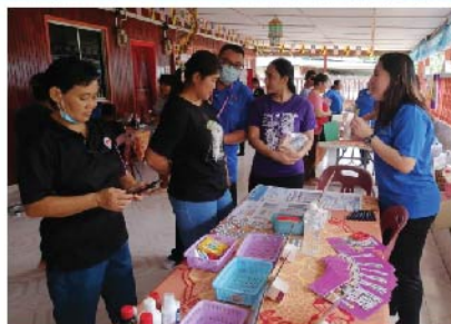
QUMC Booth at Rumah Kejaman Lassah during Health Carnival 2022

A permanent post in Belaga that came to me in the middle of a pandemic, accepted without a second thought as my contract was coming to an end back then. Working in a small town far away in the jungle where the nearest hospital and retail pharmacy are at least 204km to reach, it's a brand new adventure. Now that the road condition has greatly improved, Belaga is easily accessible by road from Bintulu. There were days when district crossing was highly restricted and I had to make use of vaccine collection trips to run around Bintulu town to source for supplies such as insulin needles, spacer device, even nutritional milk powder and tube feeding syringe for patients. Other daily supplies can be easily obtained from local grocery shops.