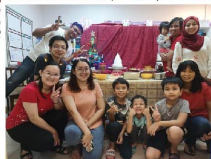
Pharmily Christmas 2022